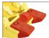
RP10-IT RP16-IT RP20-IT RP30-IT

• The interchangeable parts, like teeth plates and blades, ensure quick and easy maintenance .