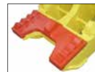
RP40-IT RP50-IT RP80-IT

• The Speed-Valve reduces opening and closing time boosting productivity.