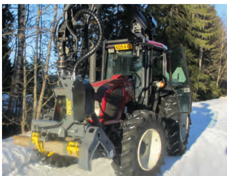
Easy to mount and transport.