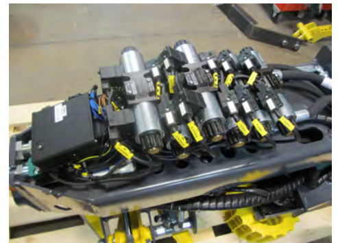
Valve board with CAN-slave module. All valves have diodes indicating functions.